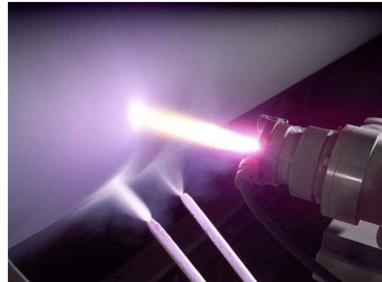
Projection au plasma (APS/VPS/APSS): Equipement